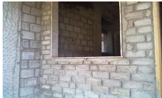
Fig. 2 Fly ash brick Masonry at Palghar.

Chemically, fly ash is a Pozzolane. When mixed with lime (calcium hydroxide), Pozzolane combine to form cementatious compounds. Concrete containing fly ash.Becomes stronger, more durable, and more resistant to chemical attack.Mechanically, fly ash also pays dividends for concrete production. Because fly ash particles are small, they effectively fill voids. Because fly ash particles are hard and round, they have a "ball bearing" effect that allows concrete to be produced using less water. Both characteristics contribute to enhanced concrete workability and durability. Finally, fly ash use creates significant benefits for our environment. Fly ash use conserves natural resources and avoids landfill disposal of ash products. By making concrete more durable, life cycle costs of roads and structures are reduced. Furthermore, fly ash use partially displaces production of other concrete ingredients, resulting in significant energy savings and reductions in greenhouse gas emissions.