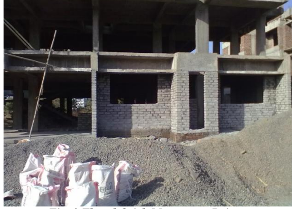
Fig. 3 Fly ash brick Masonry at Boisar.

ISSN: 2277-9655 Impact Factor: 4.116 CODEN: IJESS7